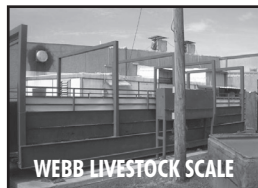
WEBB LIVESTOCK SCALE

10% Buyer's Premium will apply. Credit Card required for online registration. Payment by Cash, Cashier's Check or Check w/Bank Letter of Guarantee. Check our website for complete terms.