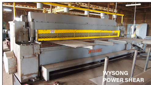
WYSONG POWER SHEAR