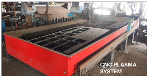
CNC PLASMA SYSTEM