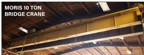
MORIS 10 TON BRIDGE CRANE