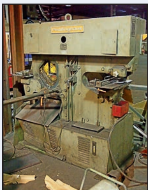
PEDDINGHAUS PEDDIMASTER IRONWORKER