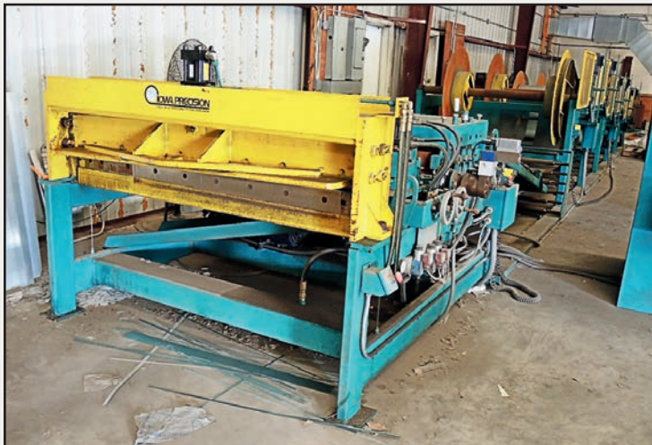
IOWA PRECISION COIL LINE

BIDDING CLOSES: Thursday, April 9, Beginning at 10:00 A.M.