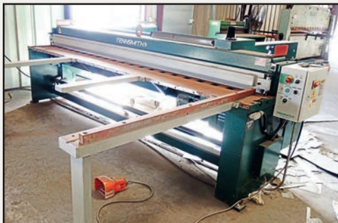
TENNSMITH POWER SHEAR