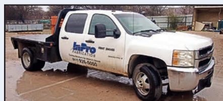
2009 CHEVROLET 3500 TRUCK