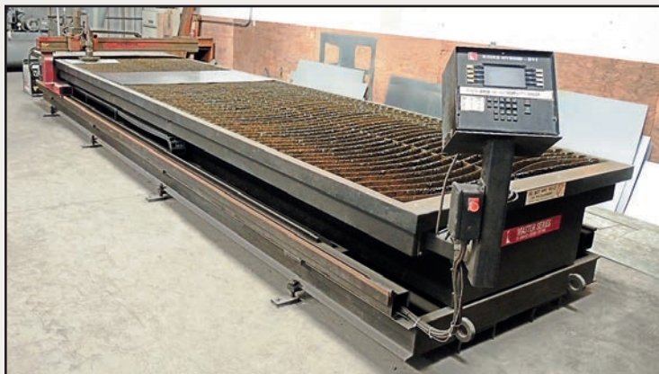
KOIKE ARONSON/ADVANCED PLASMA CUTTING SYSTEM