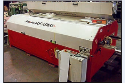
SCHLEBACH ROLL FORMER

PREVIEW: Monday, April 13, 10:00 A.M. – 4:00 P.M.