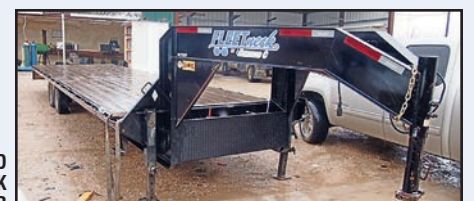
2014 DIAMOND 30' GOOSENECK TRAILER

TERMS: 15% Buyer's Premium will apply. Credit card required for online registration. Payment by cash, cashier's check or check with bank letter of guarantee. Check our website for complete terms.