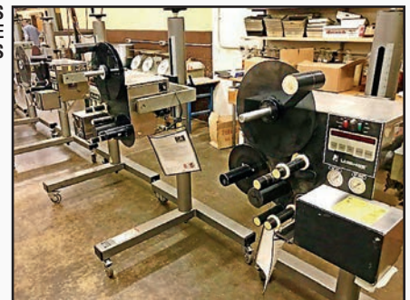
VARIOUS LABEL-AIRE LABELERS