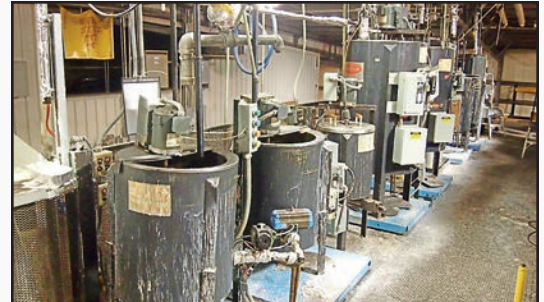
STA-WARM WAX TANKS