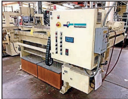
HERRHAMER CANDLE TAPER MACHINES