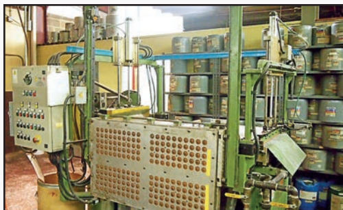
OMP TAPER MACHINE