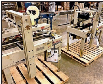
3M CASE SEALERS

TERMS: 15% Buyer's Premium will apply. Credit card required for online registration. Payment by cash, cashier's check or check with bank letter of guarantee. See our website for complete terms.