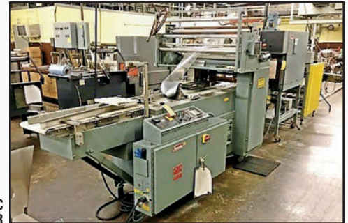
SHANKLIN S-4C SEALER