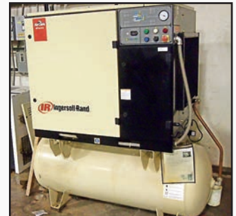
INGERSOLL-RAND MDL. UPG-30-125 COMPRESSOR