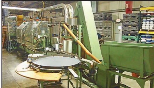
OMP TEA/VOTIVE CANDLE LINE

HERRHAMMER Wick Machine, Type EM-60/55-16, top inserter and labeler, drilling station.